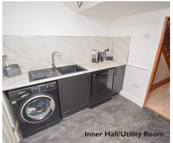
Inner Hall/Utility Room